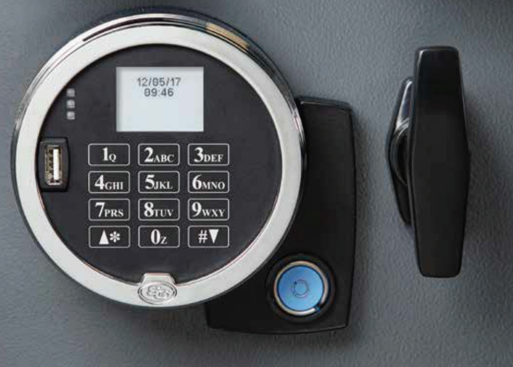
A-Series with Display combines a ground-breaking 30-character display screen with the efficiency and accuracy of a USB audit download and optional OTC app.