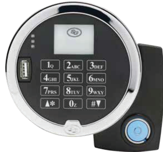
A-Series with Display

A-Series Locks store time in the lock, not on the key. This ensures that A-Series Locks are not susceptible to time drift, a critical feature that keeps A-Series audit trails highly accurate and reliable.