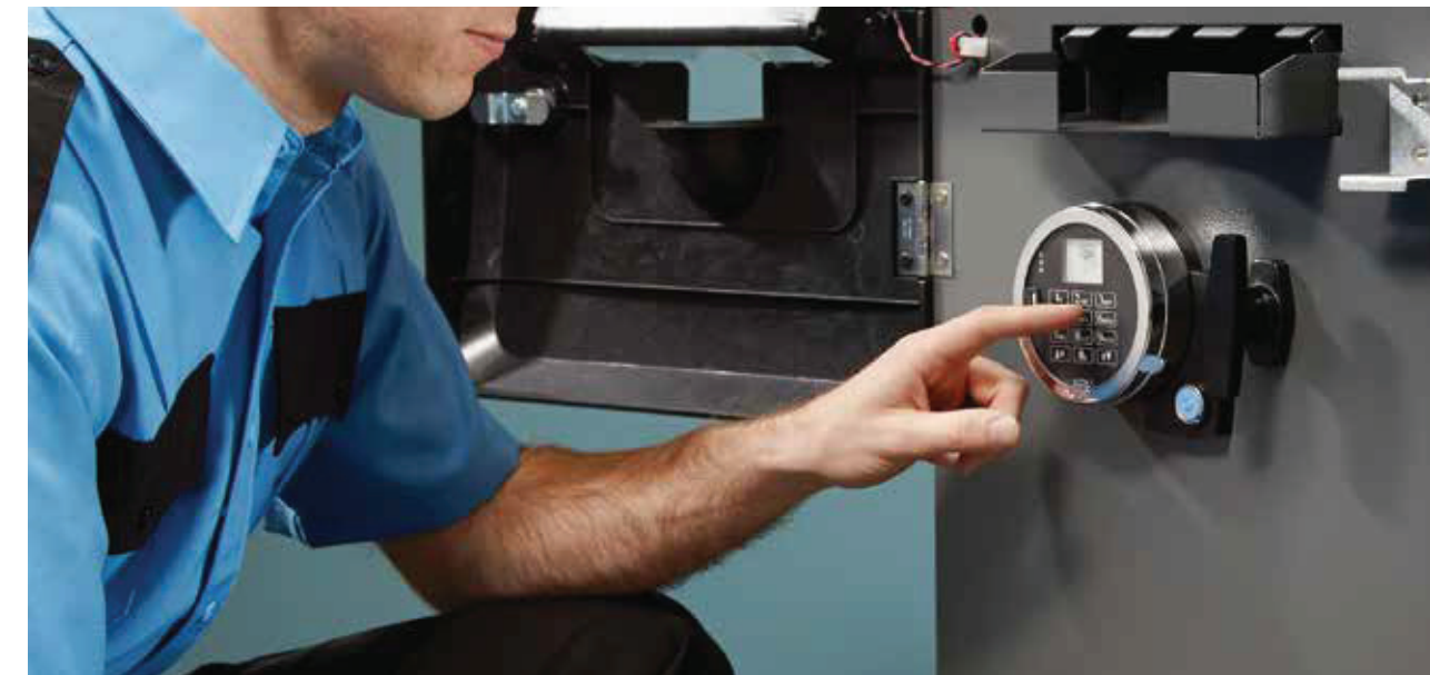
A quicker, easier, more intuitive solution for ATM security.

Multiple visual elements including extra-large display screen and keypad indicator lights, combined with the beeps and braps used by all A-Series Locks, enhance the user's ability to understand, process, and act on information quickly and accurately.